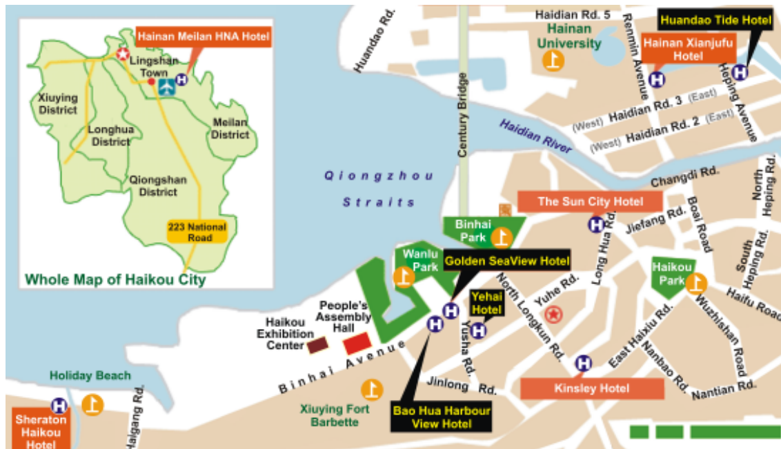
Hotels marked in black are official conference hotels with special negotiated rates for participants.